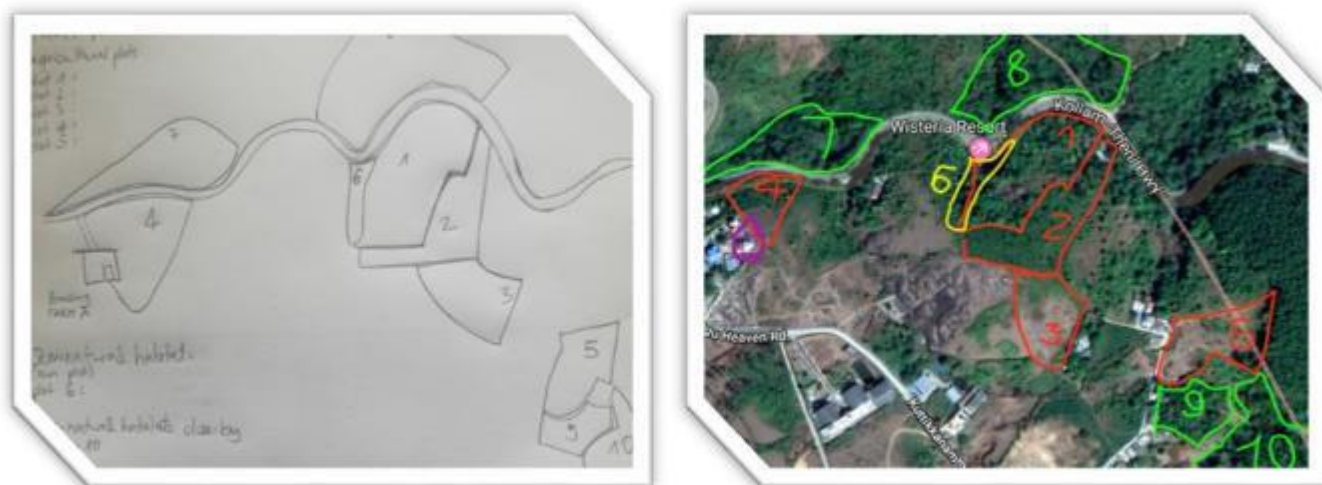
Figure 3: a) sketch of the farm land, b) satellite image of the farm land

The farmer transfers the information to a map. For this purpose, satellite images or aerial photographs can be used or, alternatively, a sketch of the farm can be made.