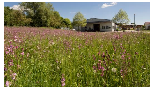
Figure 6: Example 2 of near-naturally designed premises