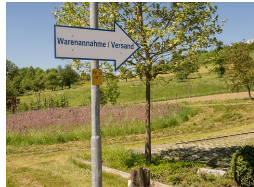
Figure 5: Example 1 of near-naturally designed premises