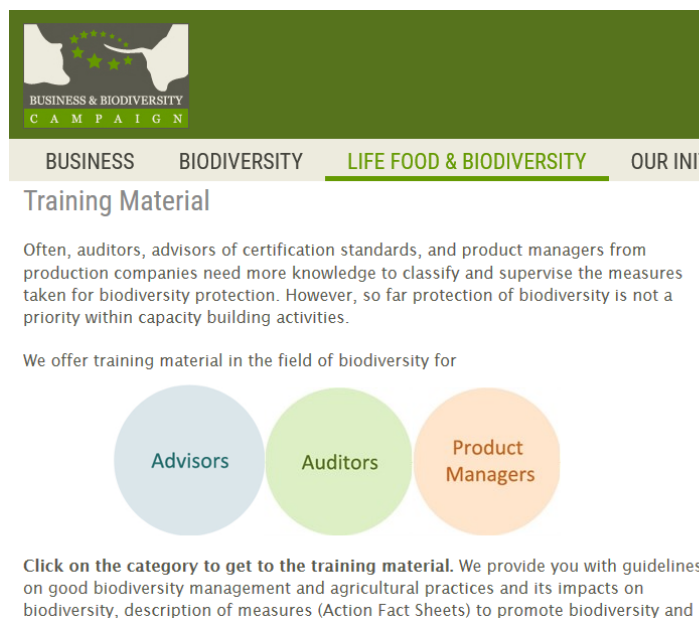
Figure 4: Screenshot of the website www.business-biodiversity.eu

www.business-biodiversity.eu/en/biodiversity-training