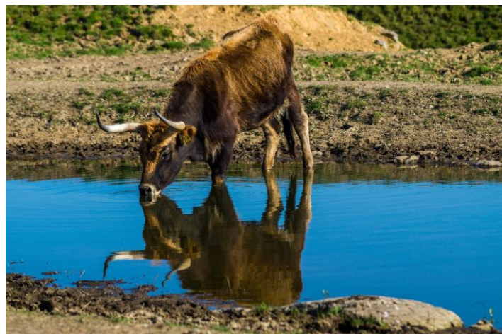
Graphic 2: Heck cattle, a hardy breed of domestic cattle with a feral population of 2000 individuals spread over Belgium, the Netherlands and Germany.

In Europe there are multiple barriers for promoting and propagating agro-biodiversity. In every EU country each plant variety needs admission by the respective registration office in order to market the corresponding seed material. The value characteristics, by which requested new variety admissions are assessed, is predominantly based on its economic value and capacity, to serve the highly intensified conventional agricultural production: yield, reproducible quality, resistance against pests, ease of cultivation, multiple use feature. Characteristics such as taste, adaptability to changing environmental conditions and cultural value are not considered or only under very urgent circumstances i.e. severe drought periods or a quick and broad spread of pest species when the lack of drought or pest resistant species poses an imminent danger. Despite these regulatory constraints, traditional species and varieties are being preserved and promoted by National authorities through