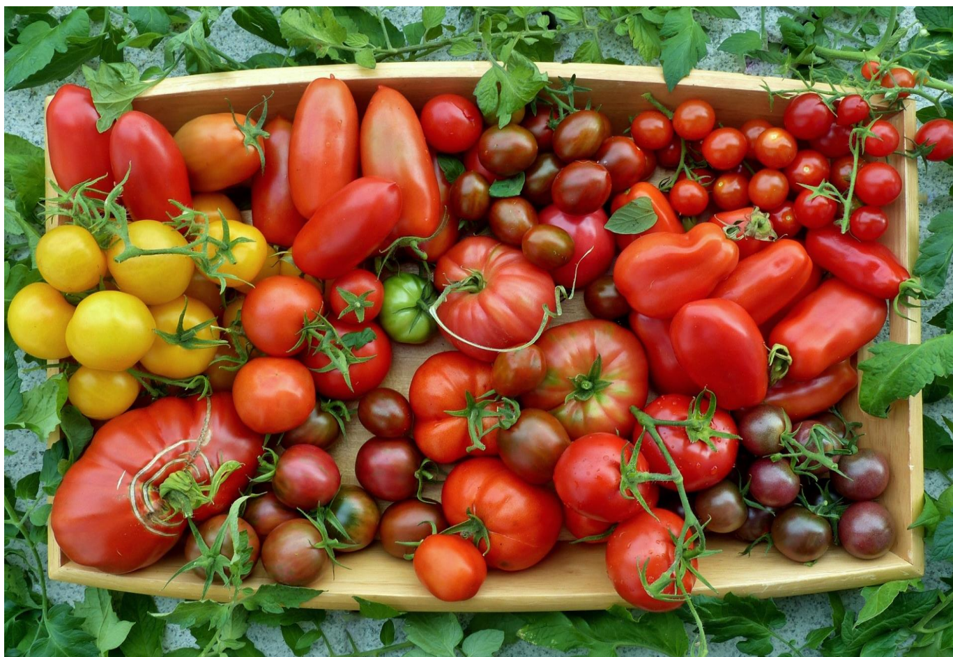
Graphic 1: Tomatoes are only one example for a common vegetable crop where more than 3,000 varieties exist as a result of human cultivation: a cultural heritage.