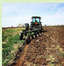
Pic. 1: Tractor with chisel plows, a good way to implement a reduced tillage with depth of around 15 cm; Pic. 2: Moldboard plows are tools used to achieve a more in-depth tillage (bad measure for soil conservation).