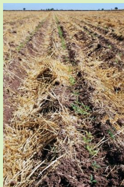
Pic. 3: Chickpea seedlings in a reduced tillage soil with wheat crop residues.