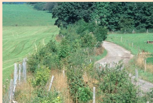
Pic. 1: A half-year old hedgerow consisting of native species, well protected from animals.