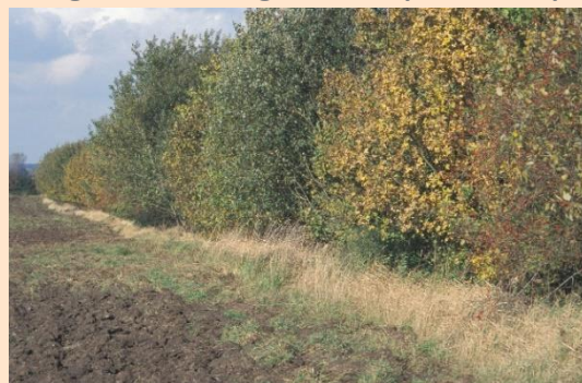
Pic. 2: A natural hedgerow from many different native species, surrounded by a 1 m buffer zone of grass strip before the agricultural used plot starts